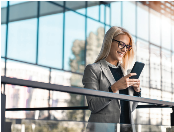
SL2 helps Financial Advisors to compliantly engage with Clients when and where they feel most comfortable by separating personal and business activity on the same smartphone

CellTrust supports customers with domestic and international phone numbers on the same phone that all ring globally, with messaging capability across the world. VOIP and messaging is encrypted for internal communication with no variable costs; external communications are traced, logged and can be archived.